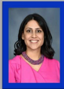
Dr. Arelys Madero

Race, ethnicity, and immigration in the juvenile justice; criminal justice systems.